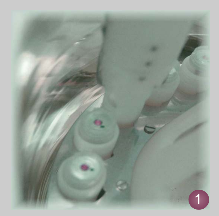
The vial is opened by a combined rotation and translation of the \phi -axis. The empty vial is moved all the way back into the storage dewar.