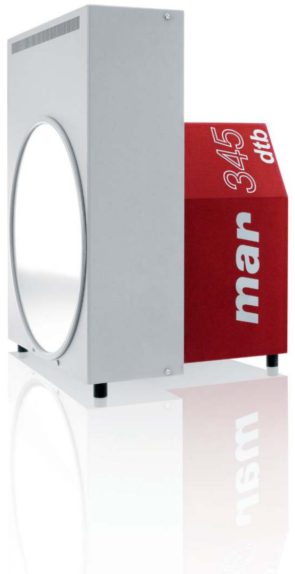
Image Plate Detector